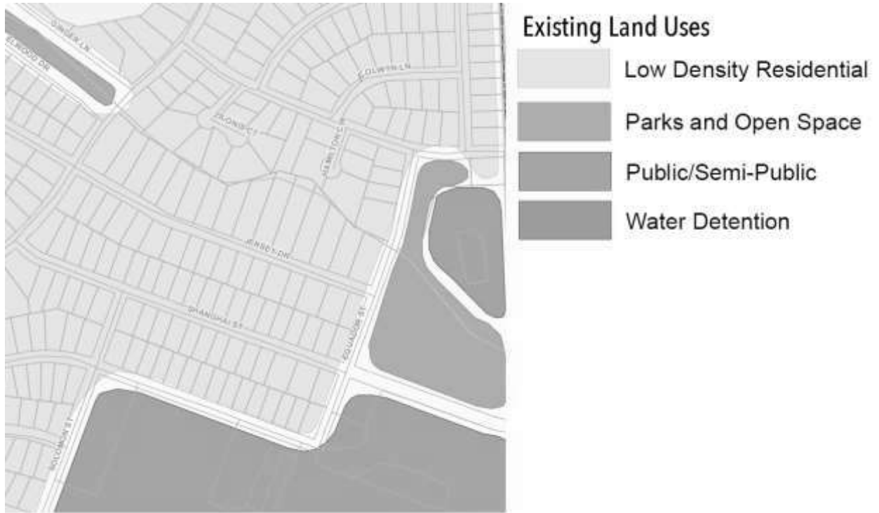
Map 3: The existing land use zoning within the TIRZ.